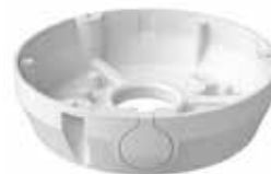
Junction Box AVM-EDMT-W-AT1